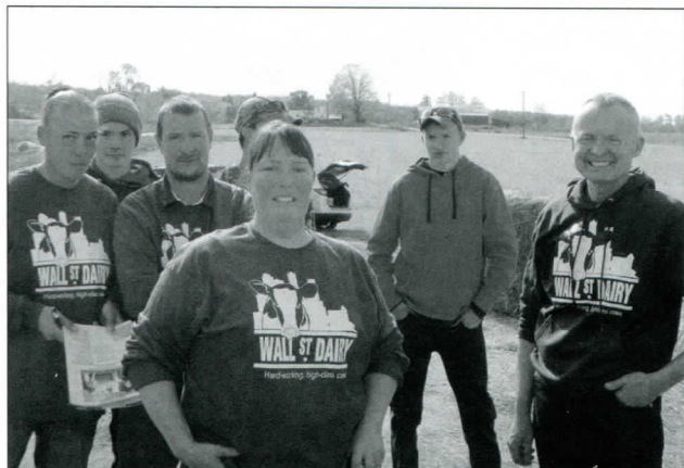
Team Wall Street taking in the sale.

Wall-St Gold Chip Daffodil (6/17) .....$2,575 S: Mr Chassity Gold Chip-ET